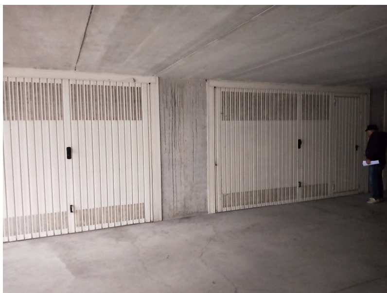
SUB 527 -SUB 528